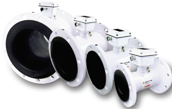
The TRU/MAG™ Magnetic Flow Meter From Neptune Technology Group.

SCADAmetrics is pleased to announce that its EtherMeter SCADA/Meter Gateway is verified compatible with the TRU/MAG™ magnetic flow meter , manufactured by Neptune Technology Group .