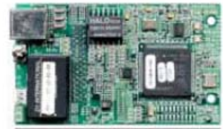
CM090 Modbus/TCP/IP Option Card

With the CM090, a maximum of 10 simultaneous connections are allowed. This implementation of MODBUS TCP/IP supports MODBUS functions 3 (read multiple registers), 6 (write single register) and 16 (write multiple registers). The Yaskawa website provides an excellent example of the product's use in a document titled, Using Yaskawa VFD's "Modbus TCP-Ethernet Option" with Allen Bradley CLX Programmable Controllers , which describes an implementation using Yaskawa's 5 and 7 series variable frequency drives with Modbus-IDA member company Prosoft Technology's MV156-MNET interface module.