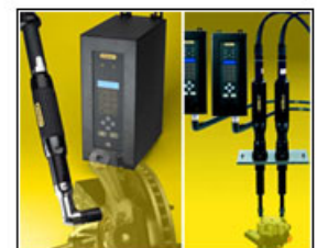
QPM Family of high performance assembly tools

The QPM Sigma Controller, Model Q3000 was tested for conformance to Modbus-IDA Conformance Test Policy Version 2.1.