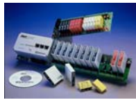
isoLynx Data Acquisition System

The system is comprised of a 12-channel base system including an I/O controller module and optional 8- or 16-channel expansion backplanes, all of which can be panel or DIN rail mounted. The system accepts single-